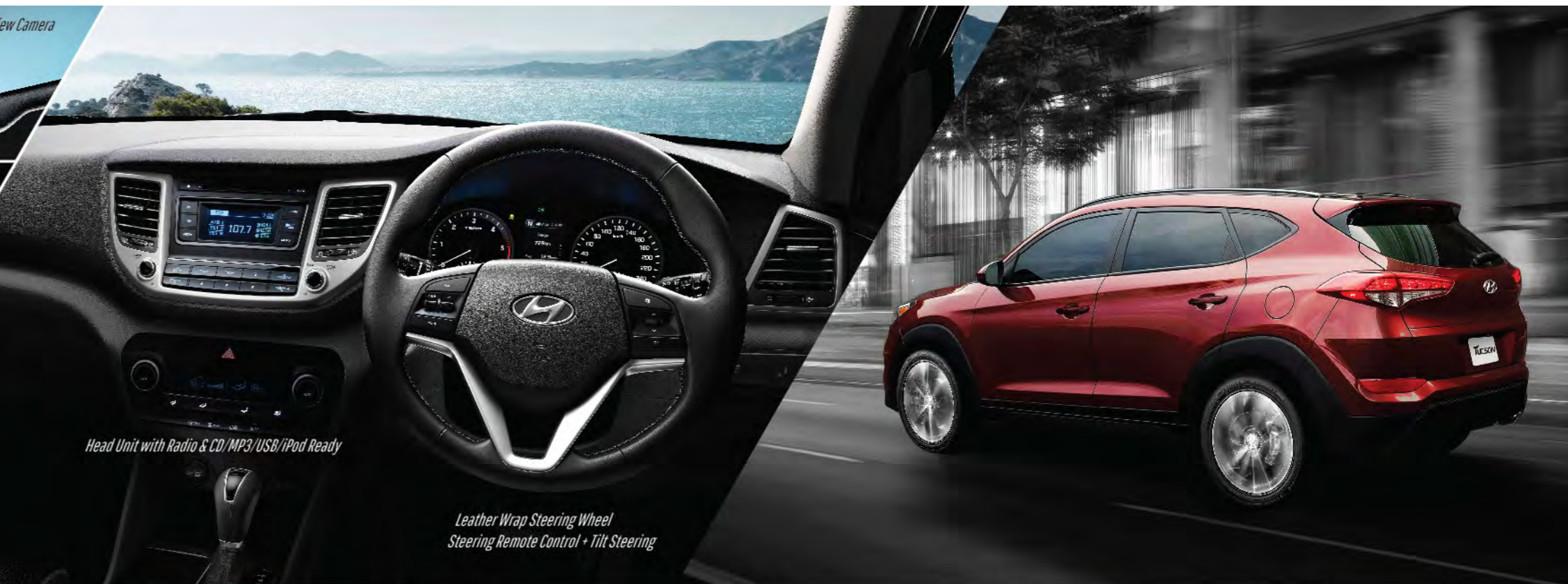
Head Unit with Radio & CD/MP3/USB/iPod Ready