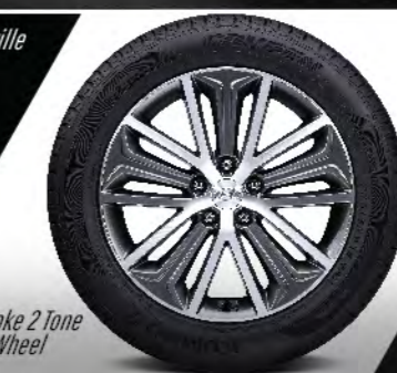
Multi Spoke 2 Tone 17 Alloy Wheel