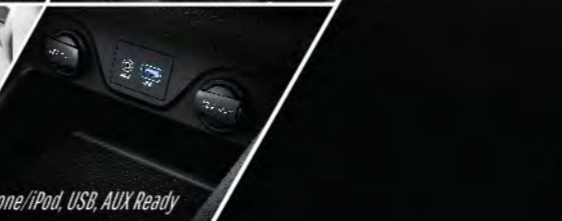
iPhone/iPod, USB, AUX Ready