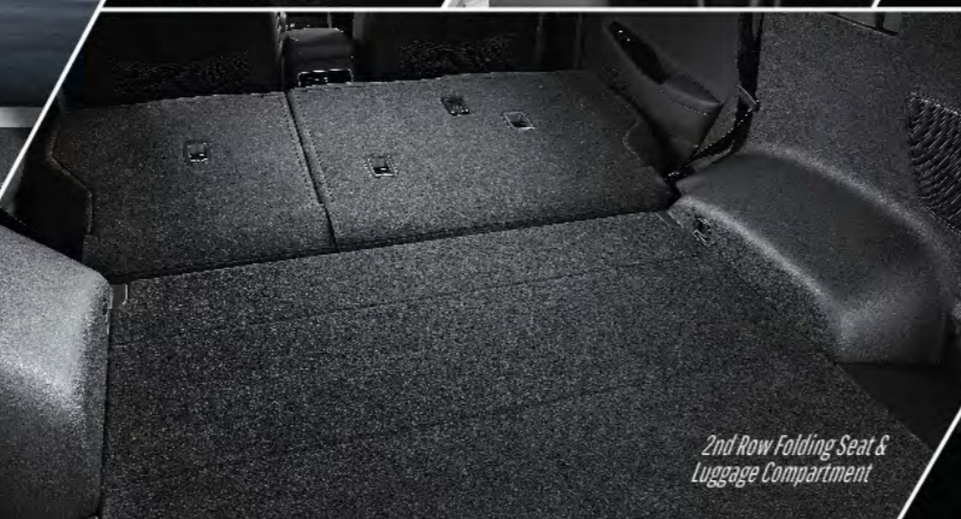
2nd Row Folding Seat & Luggage Compartment