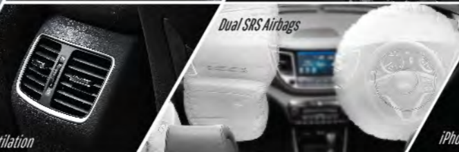
Dual SRS Airbags