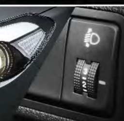
Adjuster Leveling Projection Head Lamp