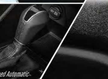
Shiftronic 6-Speed Automatic