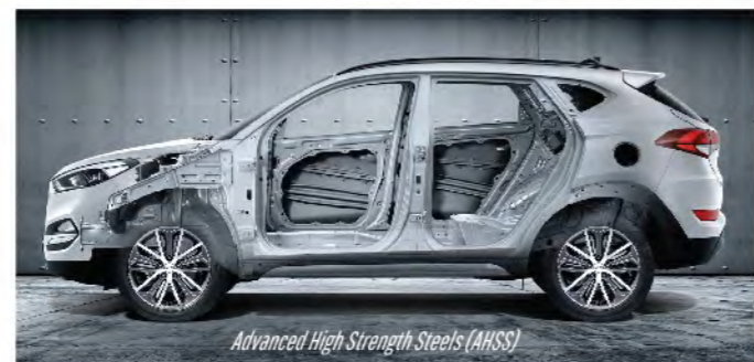
Advanced High Strength Steels (AHSS)