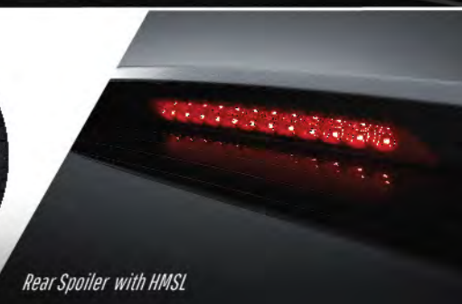
Rear Spoiler with HMSL