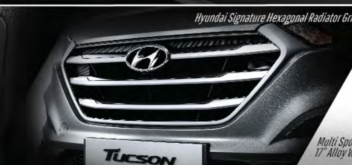
Hyundai Signature Hexagonal Radiator Grille