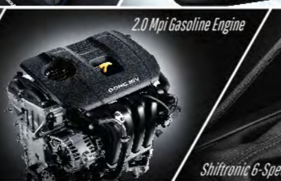
2.0 MPI Gasoline Engine