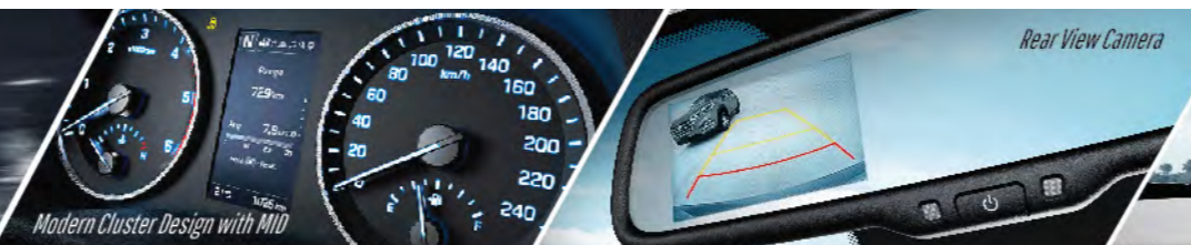
Modern Cluster Design with MID