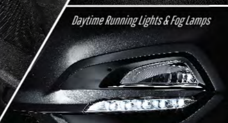
Daytime Running Lights & Fog Lamps