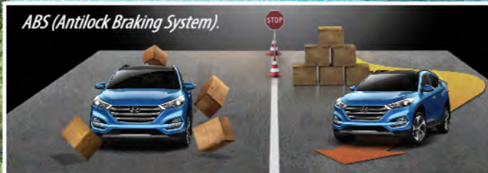
ABS (Antilock Braking System).