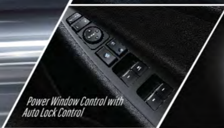
Power Window Control with Auto Lock Control