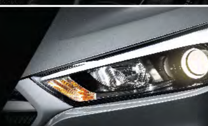
Projector Head Lamps with HID Xenon 4,300K LED Positioning Lamp